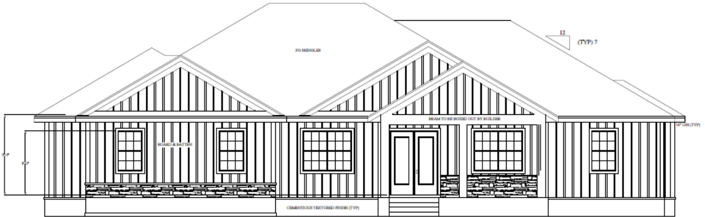
FRONT ELEVATION ALL GIVEN CALL-OUTS AND DIMENSIONS ARE TYPICAL OF ALL ELEVATIONS UNLESS OTHER WISE NOTED

Total Living: 3048 SF 4 Bedroom 3.5 Bathroom Upstairs Bonus / Bedroom with Dedicated Bathroom